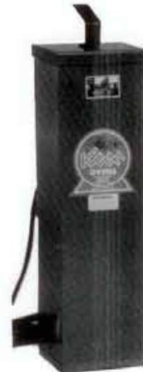
MODEL K-15 W/T