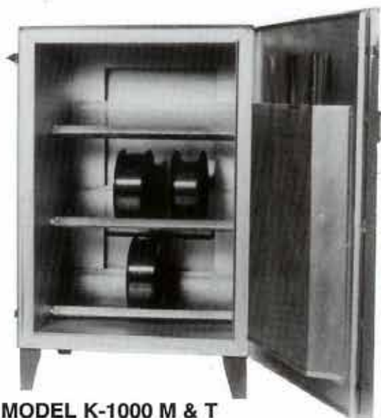
MODEL K-1000 M & T